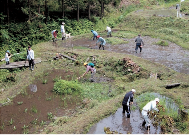
▲ (Creating feeding rounds) ▼ Volunteers create feeding grounds in the east part of the Kosado area, which used to be a habitat for Toki.