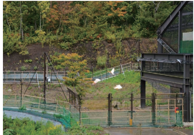
▲ (3rd release of ibises into the wild) The acclimation cage at the Reintroduction Center was opened and 13 ibises were released into the wild.

The Ministry of the Environment set a goal regarding Toki's reintroduction to the wild as part of their the Environment Restoration Vision